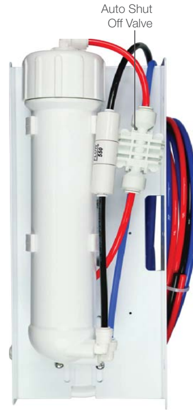
Auto Shut Off Valve

Please ensure all parts are included and undamaged. If a part is found missing or damaged, please contact our customer service department.