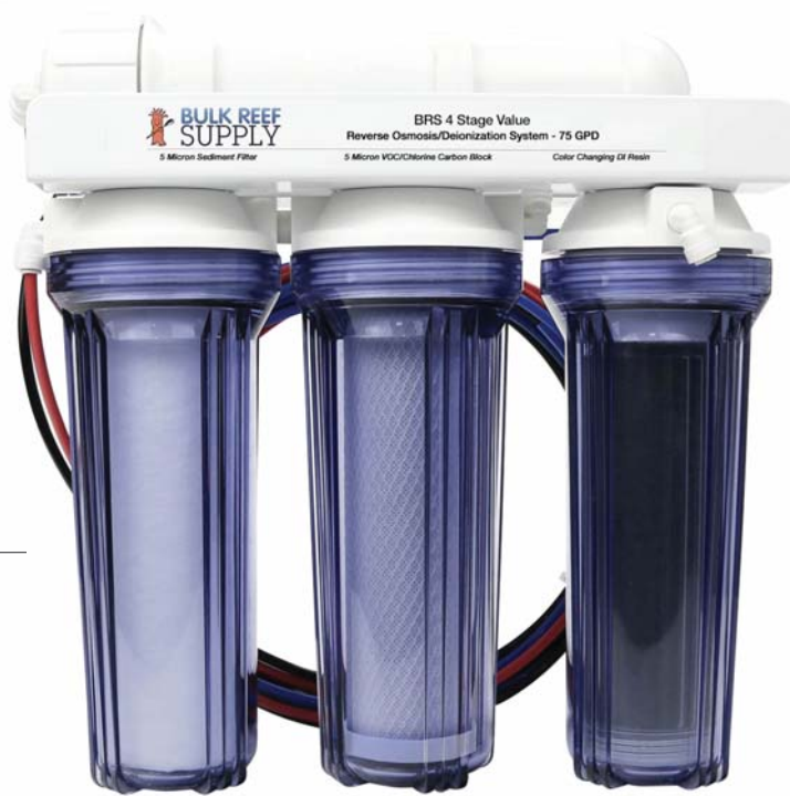
BRS 5 Micron VOC Carbon Block