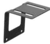
· Top Mounting Adapter