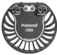
· H80 - Tuna Flora