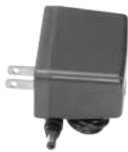
· DC Power Supply